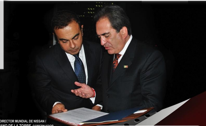
■ CARLOS GHOSN, DIRECTOR MUNDIAL DE NISSAN / ING. CARLOS LOZANO DE LA TORRE, GOBERNADOR CONSTITUCIONAL DEL ESTADO DE AGUASCALIENTES